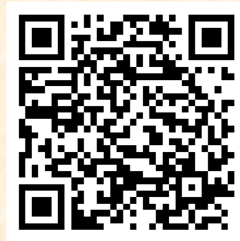
4 Pic 1 Word - android