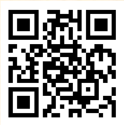
4 Pic 1 Word - ios